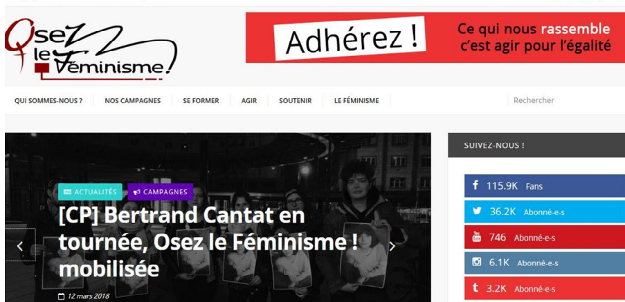
Figure 5 Dare to Be a Feminist (Osez le Féminisme) Appeal to join (website page downloaded on 12 March 2018)

Activists welcome the coming of sympathizers to their face-to-face meetings with no need to become an official member. Dare to Be a Feminist, for instance, organizes regular assemblies which gather, as we observed, young women who do not know much about feminism but are searching for infor-