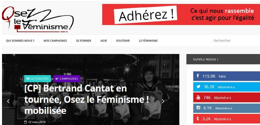
Figure 5 Dare to Be a Feminist (Osez le Féminisme) Appeal to join (website page downloaded on 12 March 2018)

Activists welcome the coming of sympathizers to their face-to-face meetings with no need to become an official member. Dare to Be a Feminist, for instance, organizes regular assemblies which gather, as we observed, young women who do not know much about feminism but are searching for infor-