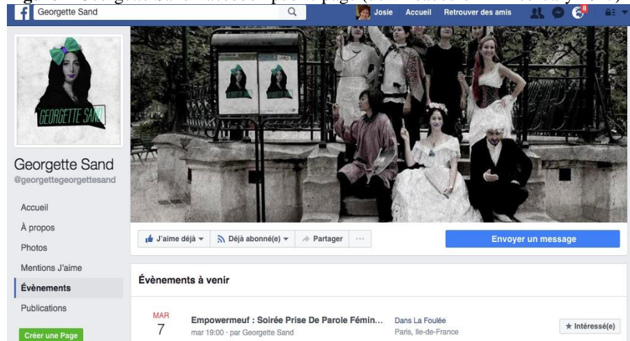
Figure 1 Georgette Sand Facebook public page (downloaded on 24 February 2017)

The nostalgia for past feminism (Rentschler and Thrift, 2015) is featured in the iconography of a few websites which often make brief references to the history of feminism. Some collectives, like The Beard, display designs, in sepia colors, featuring photographs of the past on which are pasted symbolic objects of the collective as shown in the screen capture below.