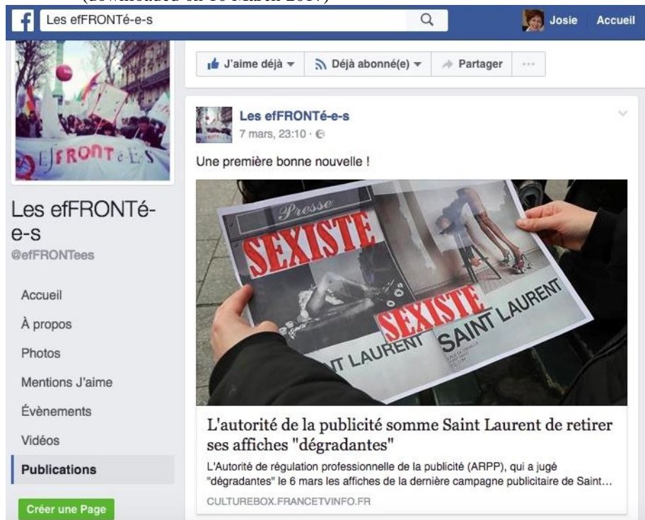
Figure 4 The Impertinent (Les Effrontées) public Facebook page (downloaded on 10 March 2017)

The organization of events and campaigns represent the achievements of activist groups and the materials of their struggles (posters, texts, photos, videos, press coverage) are put, for collective memory, in the archives section of their websites.