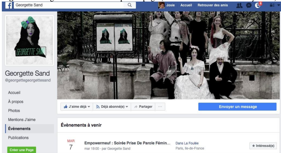
Figure 1 Georgette Sand Facebook public page (downloaded on 24 February 2017)

The nostalgia for past feminism (Rentschler and Thrift, 2015) is featured in the iconography of a few websites which often make brief references to the history of feminism. Some collectives, like The Beard, display designs, in sepia colors, featuring photographs of the past on which are pasted symbolic objects of the collective as shown in the screen capture below.