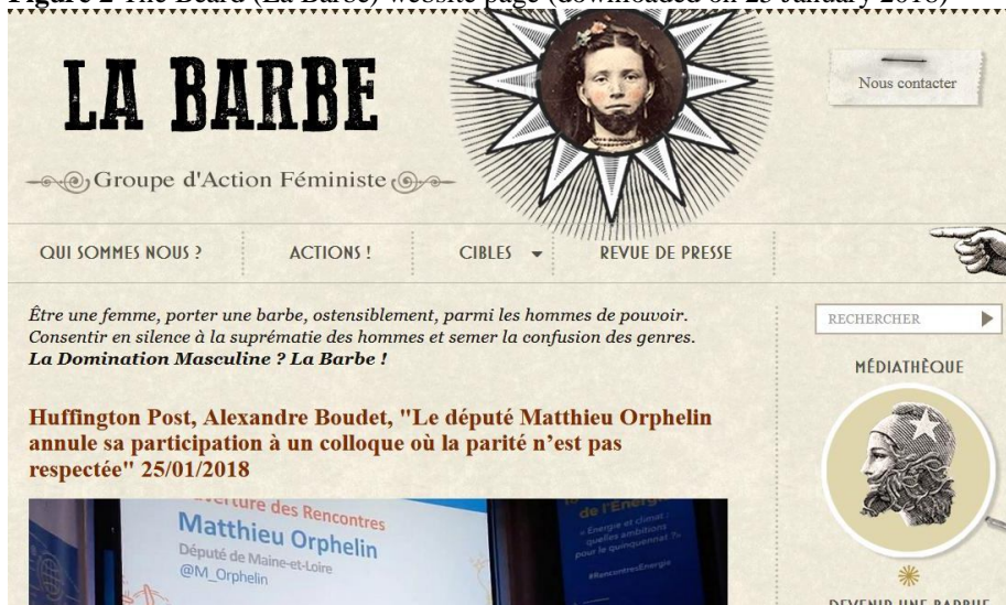
Figure 2 The Beard (La Barbe) website page (downloaded on 25 January 2018)

The majority of posts fit into the 21st century cultural codes of communication and resort to a witty tone. “Online feminists deploy social media tactics as powerful tools of community building and political mobilisation in ways that take from the content and style of other satirical practices of Internet culture...” (Rentschler and Thrift, 2015: 2). Young feminists have appropriated internet culture, however these authors do not mention that humor and satire was a mode of communication of the youth revolt in the late 1960s and that feminists of the seventies used it a lot. This continuity, over decades, in the cultural and political forms of feminism which appeal to humor, caricature and transgression of patriarchal norms is worth underlining.