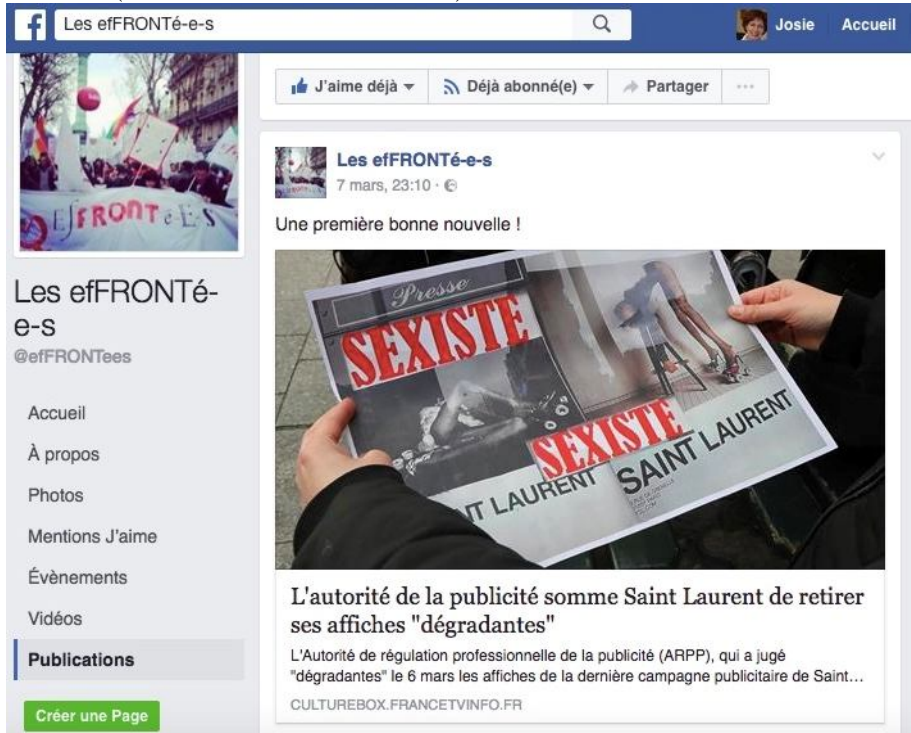
Figure 4 The Impertinent (Les Effrontées) public Facebook page (downloaded on 10 March 2017)

The organization of events and campaigns represent the achievements of activist groups and the materials of their struggles (posters, texts, photos, videos, press coverage) are put, for collective memory, in the archives section of their websites.