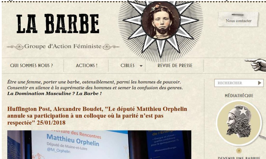
Figure 2 The Beard (La Barbe) website page (downloaded on 25 January 2018)

The majority of posts fit into the 21st century cultural codes of communication and resort to a witty tone. “Online feminists deploy social media tactics as powerful tools of community building and political mobilisation in ways that take from the content and style of other satirical practices of Internet culture...” (Rentschler and Thrift, 2015: 2). Young feminists have appropriated internet culture, however these authors do not mention that humor and satire was a mode of communication of the youth revolt in the late 1960s and that feminists of the seventies used it a lot. This continuity, over decades, in the cultural and political forms of feminism which appeal to humor, caricature and transgression of patriarchal norms is worth underlining.